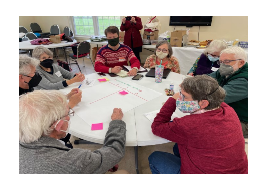
NDN's Board & Staff @ fall retreat

Despite Covid restrictions, NDN added 16 new riders to its roster between October of 2020 and October of 2021 and brought on 16 new drivers.